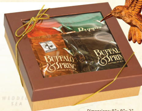
Dimensions: 8"x 8"x 2"

Contains: 1 Marseilles French Roast 2.5oz Coffee, 1 Earth Song 2.75oz Coffee, 1 Colombian Reserve 2.5oz Coffee, 1 Colombian SWP Decaf 2.5oz Coffee