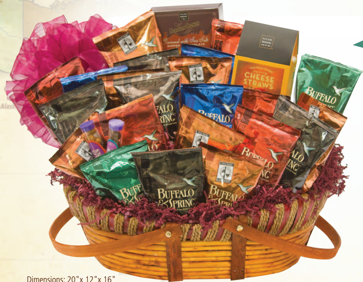
Dimensions: 20"x 12"x 16"