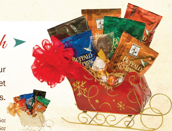
Dimensions: 12"x 8"x 12"

Contains: 1 Guatemala Huehuetenango 2.5oz Coffee, 1 French Vanilla 2.5oz Coffee, 1 Saavian 3.25oz Coffee, 1 Colombian Reserve 2.5oz Coffee, 1 Colombian Reserve Decaf 2.5oz Coffee, 1 Tonga 2.5oz Coffee, 2 Chocolate Lindt Truffles, 1 Chocolate Spoon