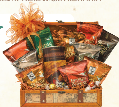
Dimensions: 12"x 8"x 12"

Contains: 1 Saavian 3.25oz Coffee, 1 Cayman Caribbean 2.5oz Coffee, 1 Colombian Reserve 2.5oz Coffee, 1 Earth Song 2.75oz Coffee, 1 Ethiopian Yirgacheffe 2.5oz Coffee, 1 Tonga 2.5oz Coffee, 1 Sumatra Mandheling 2.5oz Coffee, 1 Beija-Flor 3.25 Coffee, 1 Guatemala Huehuetenango 2.5oz Coffee, 1 Colombian SWP Decaf 2.5oz Coffee, 1 12oz Container European Dark Chocolate Cocoa, 3 Chocolate Lindt Truffles