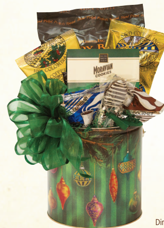
Dimensions: 8"x 8"x 12"

Contains: 1 100% Colombian 1.5oz Coffee, 1 Traditional Gourmet 1.5oz Coffee, 1 Colombian Gourmet 1.75oz Coffee, 1 European Select 1.5oz Coffee, 1 Bakery Blend 14oz Coffee, 1 Box Moravian Cookies, 1 Chocolate Spoon