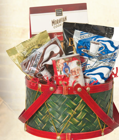
Dimensions: 8"x 8"x 10"

Contains: 1 Kona Classic 1.5oz Coffee, 2.5oz Container of Hot Chocolate, 1 Bakery Blend 3.25oz Coffee, 1 Colombian Gourmet 1.75oz Coffee, 1 Traditional Gourmet 1.5oz Coffee, 1 Cocoa, 1 Box Moravian Cookies