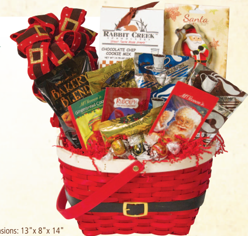
Approximate Dimensions: 13" x 8" x 14"

Contains: 1 Bakery Blend 3.25oz Coffee, 1 100% Colombian 1.5oz Coffee, 1 European Select 1.5oz Coffee, 1 Colombian Gourmet 1.75oz Coffee, 1 Traditional Gourmet 1.5oz Coffee, 1 Box Cookie Mix, 3 Packets Gourmet Hot Chocolate, 1 Cookie Cutter, 3 Chocolate Lindt Truffles