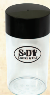
S&D Coffee & Tea Vacuum Canister

The canister will hold up to 1 pound of coffee.