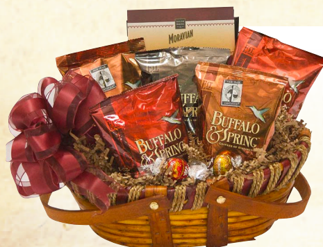
Dimensions: 12"x 8"x 12"

Contains: 1 Earth Song 2.75oz Coffee, 1 Ethiopian Yirgacheffe 2.5oz Coffee, 1 Marseilles French Roast 2.5oz Coffee, 1 Costa Rican Tarrazu 2.5oz Coffee, 1 Saavian 3.25oz Coffee, 1 Moravian Cookie, 2 Chocolate Lindt Truffles